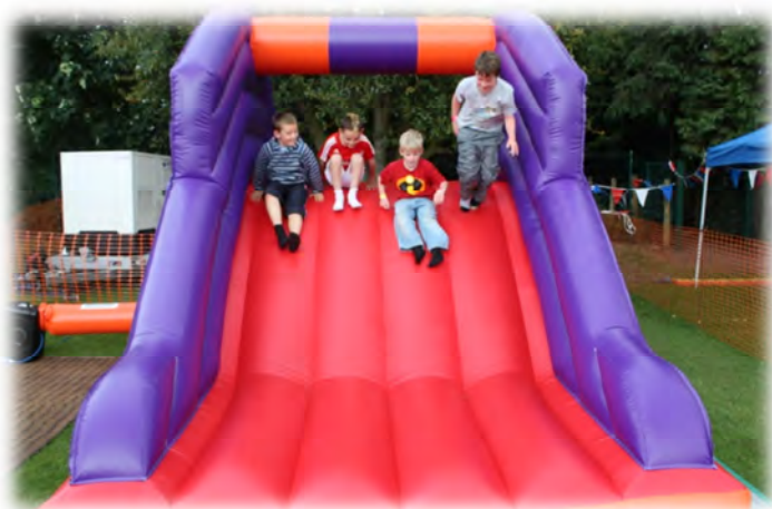
A host of inflatables for everyone