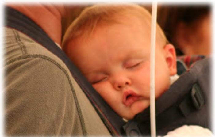
It's been a tiring day