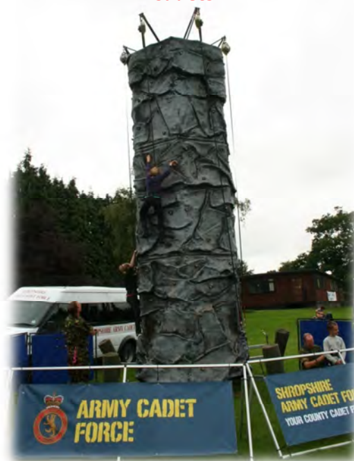
Free Climbing Wall in 2009

Whilst there has been no formal consultation since the original questionnaire survey was undertaken with children in the local schools prior to the first Festival, comments and feedback received from visitors to the previous Festivals were considered in detail by the Organising Team in planning the activities for 2009.