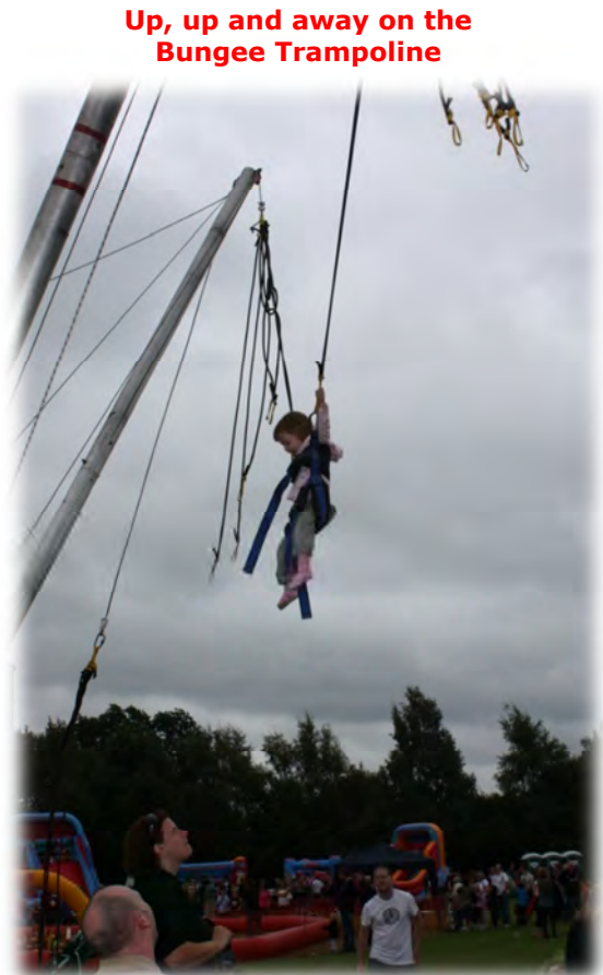
Up, up and away on the Bungee Trampoline