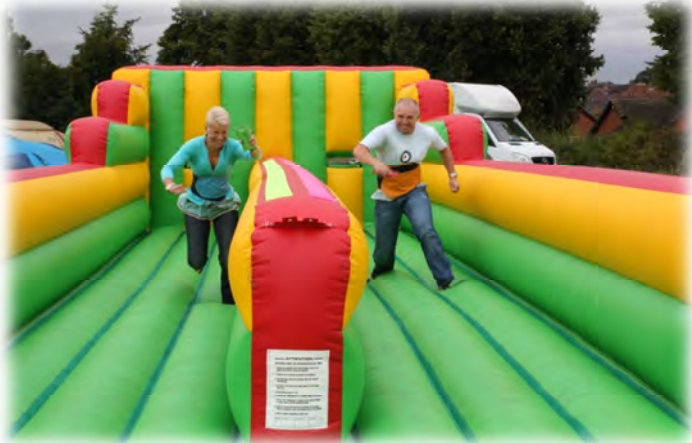
It's not just for kids – adults can join in too

We thank all those who have actively and financially supported the Festival during 2009.