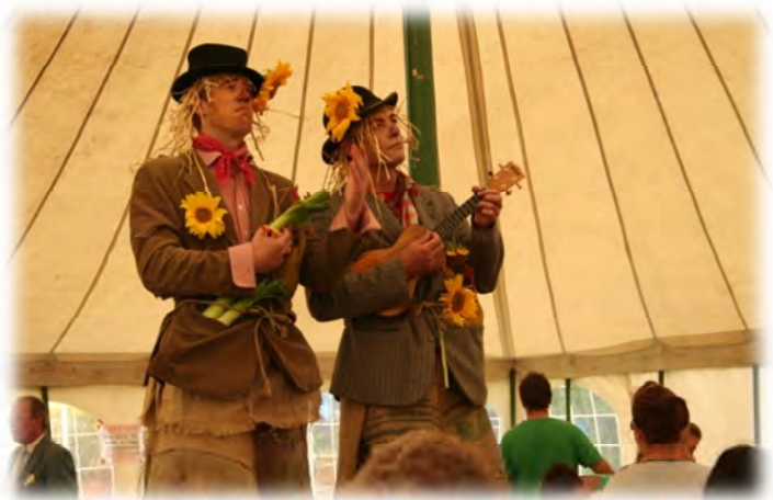
Harley Entertainments – strolling minstrels