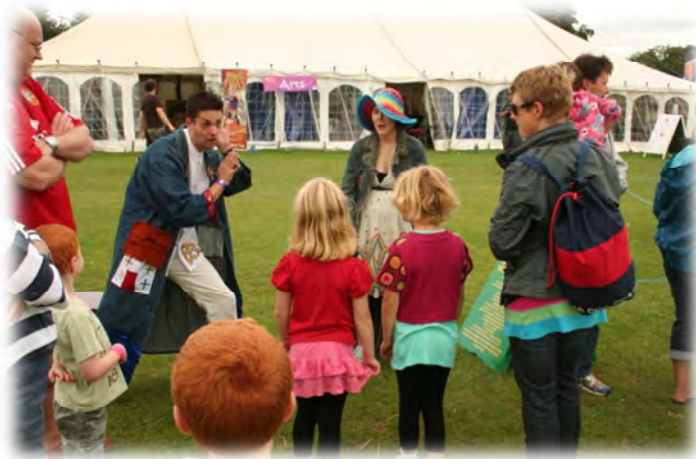
Snail Tales – roving story tellers