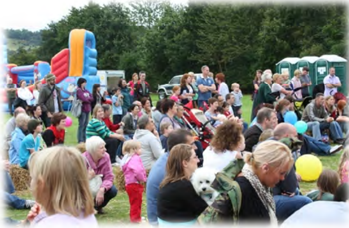
A host of activities for all the family

Regretfully it was not possible to develop an on-line questionnaire in time for this Festival but it remains a short term goal to provide this facility as well as provide a facility to submit comments and suggestions via the Festival website and/or social networking sites such as Facebook and MySpace.