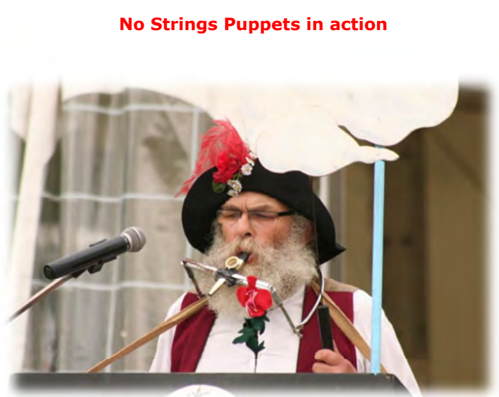
No Strings Puppets in action