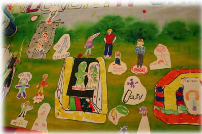
Part of the Big Art activities