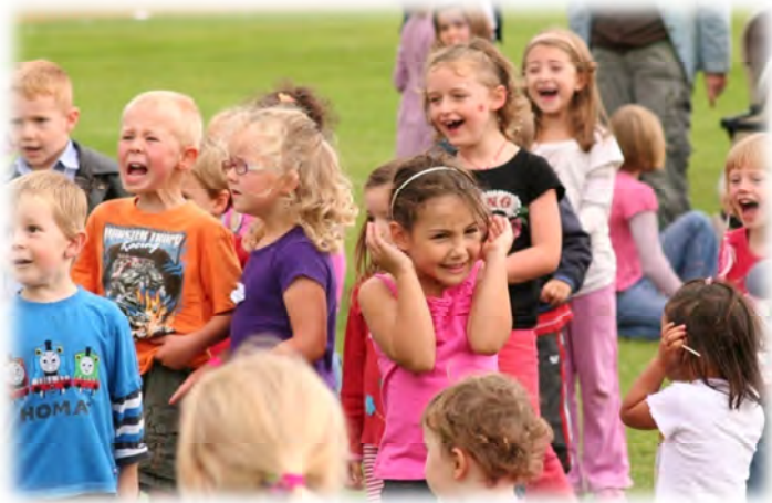
Happy smiling faces – a Festival dream

As in previous years we appreciate greatly the numerous unsolicited emails and telephone calls we receive from visitors complementing the Festival.