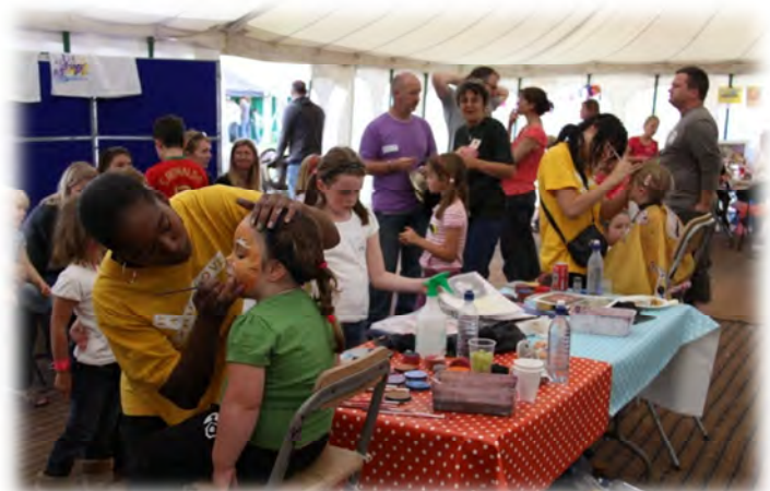
The Arts Zone - always a popular attraction

The Organising Team is once more extremely grateful to the Governors, Head and staff of the School for allowing us to use their facilities free of charge.