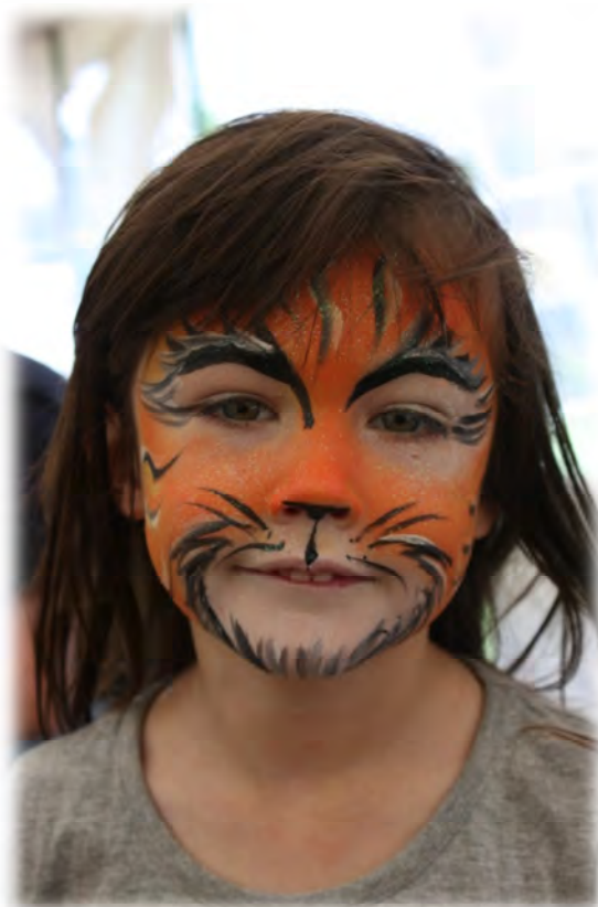
Ever popular facepainting