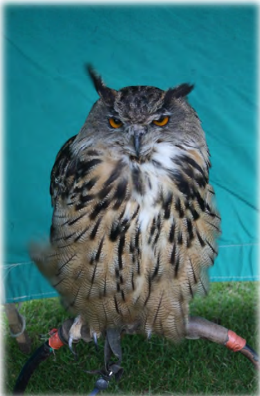
Here's looking at you kid!